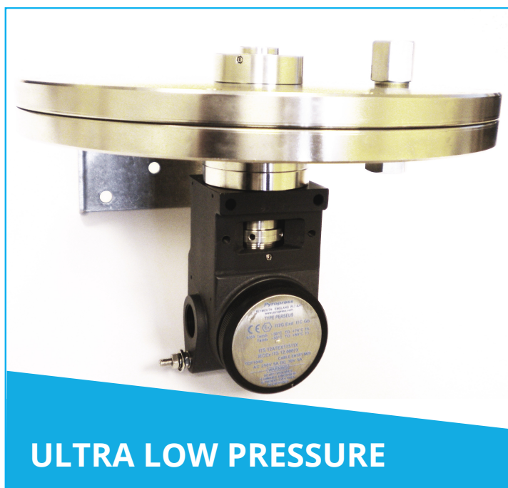
ULTRA LOW PRESSURE

One of the benefits of the Perseus range is the separation of the flameproof and adjustment chambers allowing adjustment of the set point with power on and the switch in operation. The housing is available with one or two electrical entries